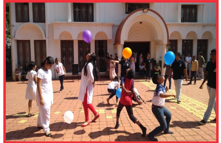
Sunday School kids had a gala time participating in the sports day conducted at church on 10 Nov '19.