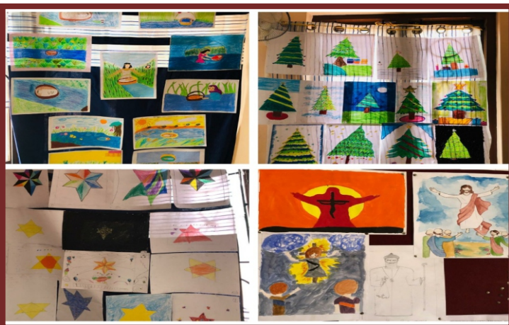
A treat to watch: A Display of our drawing talents after the unit level arts competition conducted on 31 Oct '19.