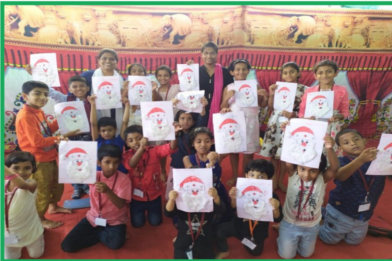
The below 10yr age group children proudly showcasing the craft work. Overall 18 Students from our parish attended the One Day Conference